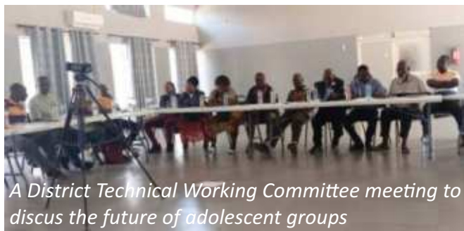
A District Technical Working Committee meeting to discuss the future of adolescent groups