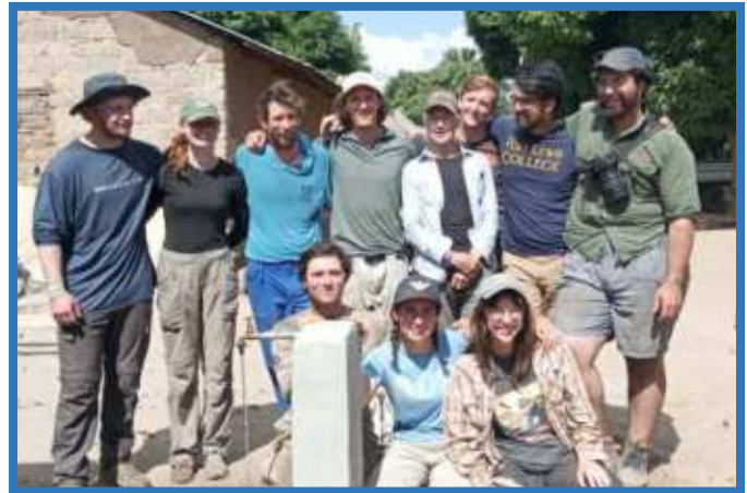
Village Aid Project (VAP) team at one of the taps after connecting water to Siyowi Village