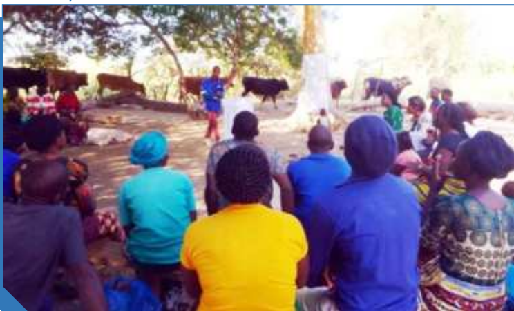
A VDT member from Mpasu Village demonstrating how to conduct a transparency meeting