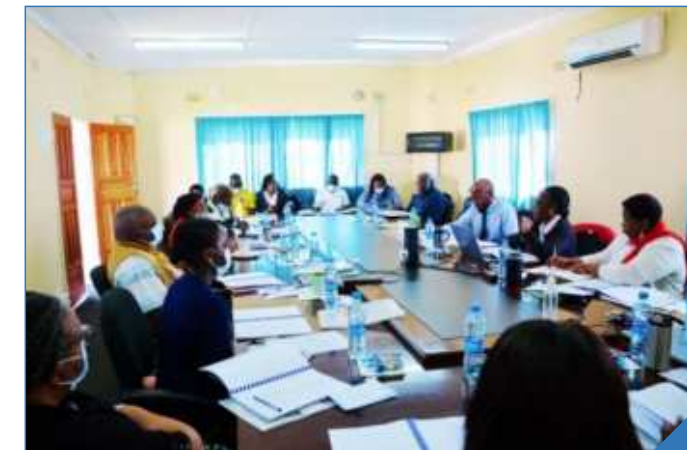
PAF 24th AGM in session at Head Office in Lusaka