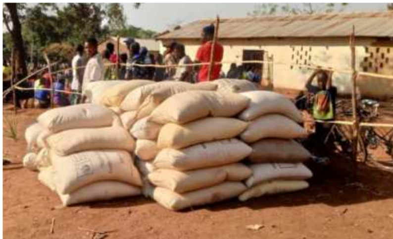
Mambwe residents wait patiently to collect relief maize

PAF is working with government line ministries of Education, Agriculture, Social Welfare and other partner organisation in the relief white maize distribution exercise in the district.