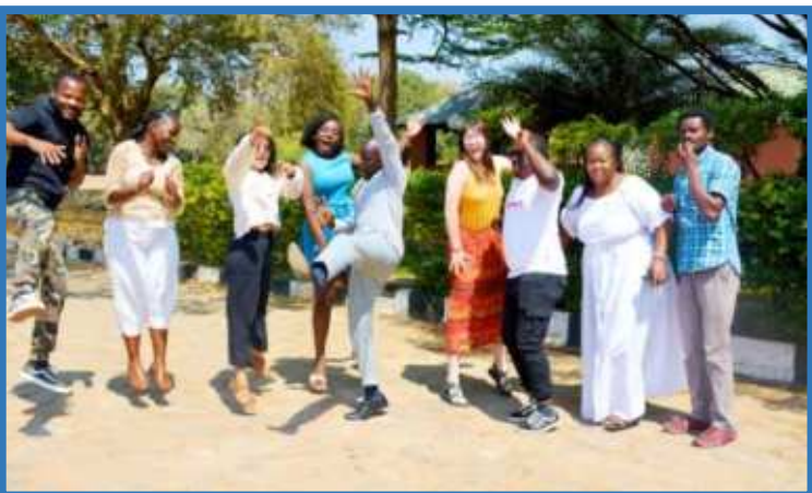
PAF field staff celebrate the end of a 2-week intensive training workshop