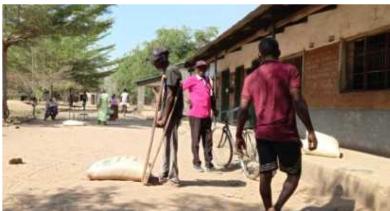
Mambwe residents regardless of their status are benefiting