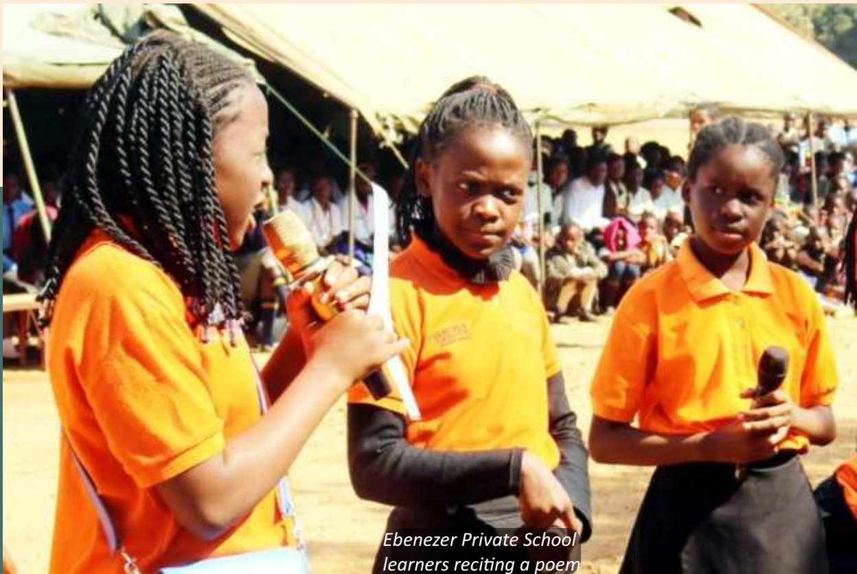
Ebenezer Private School learners reciting a poem