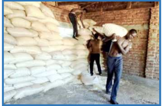
Mambwe residents collecting relief maize from the shed for distribution to beneficiaries