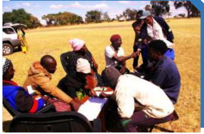
Mpasu Community Bank committee giving out loans to the applicants