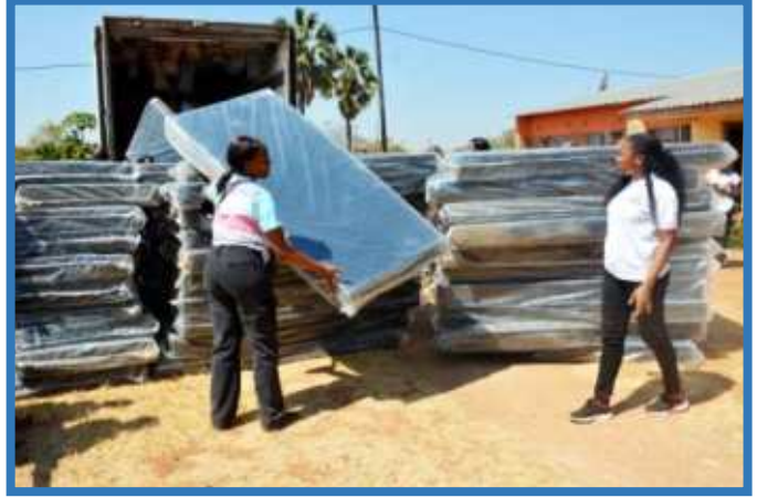
One of the team members offloading mattresses from the truck