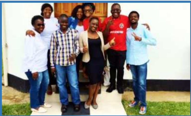
PAF team happily ending a staff project review