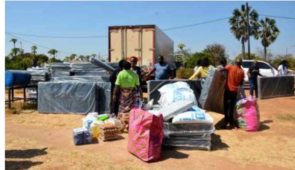
Left: The team members taking the mattresses for storage