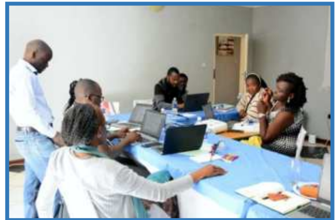
PAF field staff during a training workshop conducted by Shanta Foundation at Royal Laricio in Mazabuka