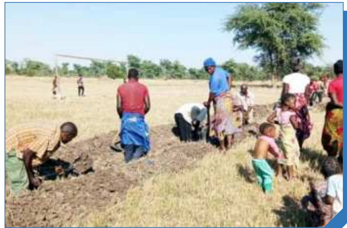
Community participation during the digging of trenches for the water pipes in Siyowi