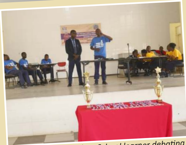
St Edmund's Secondary School learner debating against Mazabuka Girls Secondary School