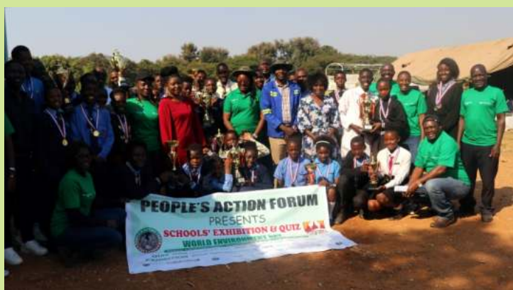
A group photo for the Quiz & Exhibition winners

The quiz activity, which was held a day before the WED