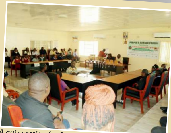
A quiz session for Primary Schools at the Council Chamber during Environment Day celebration