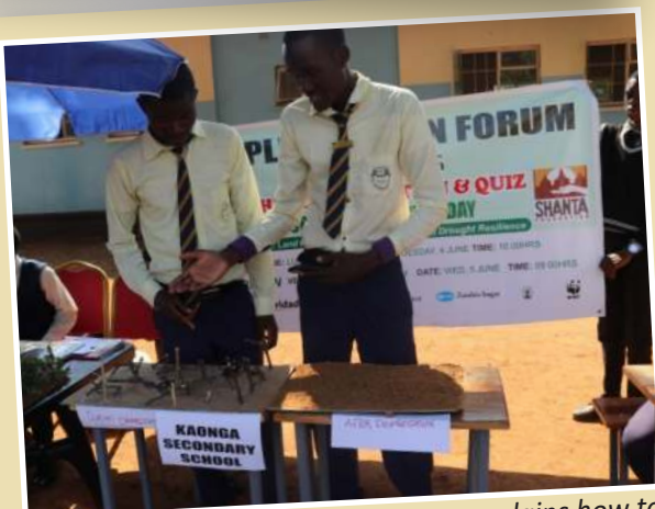
A Kaonga Secondary School learner explains how to combat deforestation during WED Exhibition