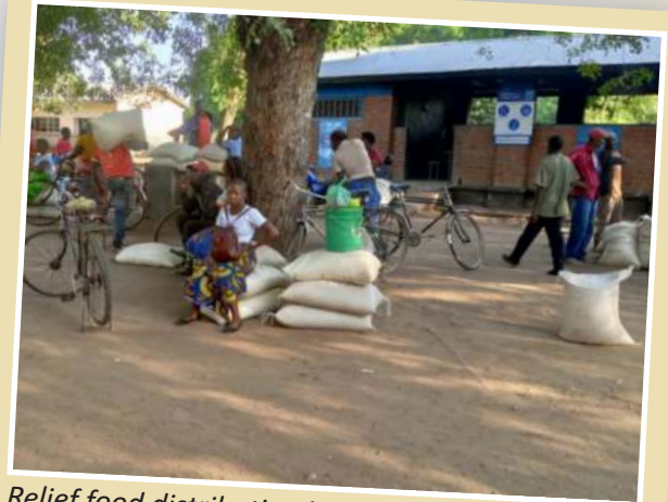
Relief food distribution in Mambwe District where PAF has been contracted by DMMU as PIP