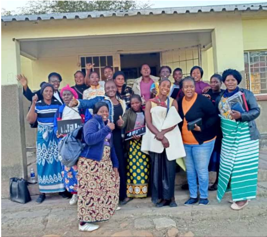
Excited trained GAF mentors pose for a group photo at Siyowi Primary School

W ith hope and determination, the community of Siyowi has embraced the Girl's Action Forum (GAF) project aimed at addressing barriers to education and fostering positive personal development for girls.