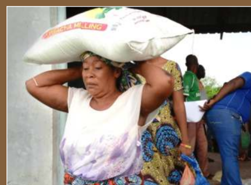
A recipient of relief maize walks home