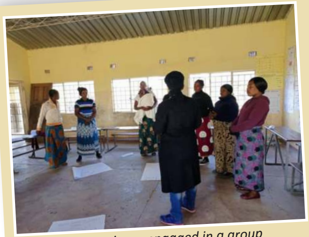
GAF trainees engaged in a group activity during the training