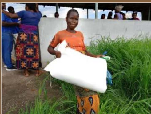
At last! Household food security assured

Through community meetings, focus groups, and grassroots engagements, PAF ensures that every voice is heard and every perspective valued.