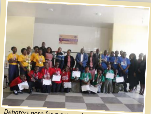
Debaters pose for a group photo after the World Day Against Child Labour competition