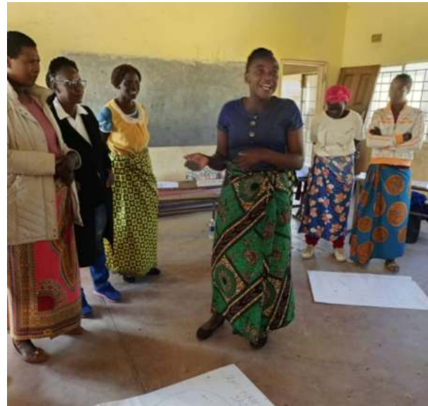
A participant making a presentation during a GAF training for school and community mentors

Three teachers and twelve community mentors went through a two day training conducted by PAF in partnership with SHANTA Foundation under the Community-Led Village Development Project being implemented in Siyowi.