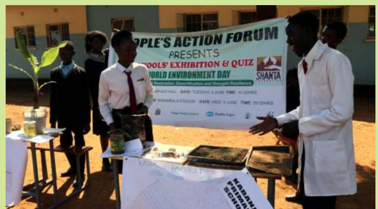
Kabanje Primary School learner explaining during the exhibition