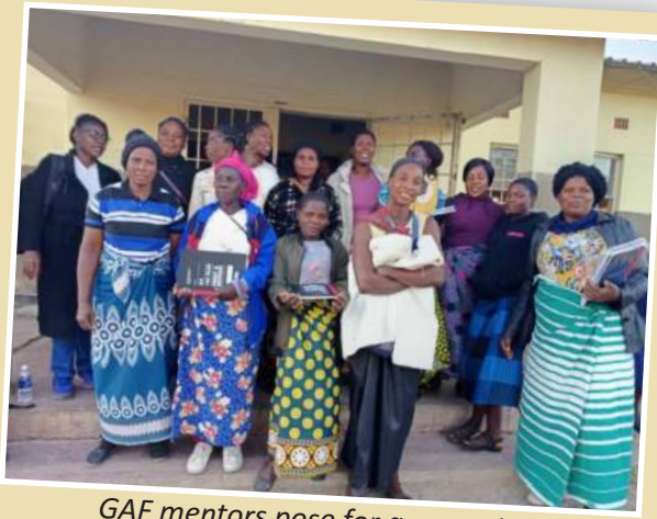
GAF mentors pose for a group in Siyowi after the training