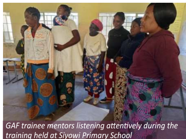
GAF trainee mentors listening attentively during the training held at Siyowi Primary School