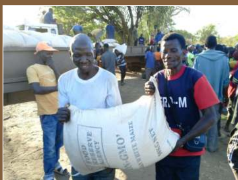
Two men happily help each other carry the relief bag of maize