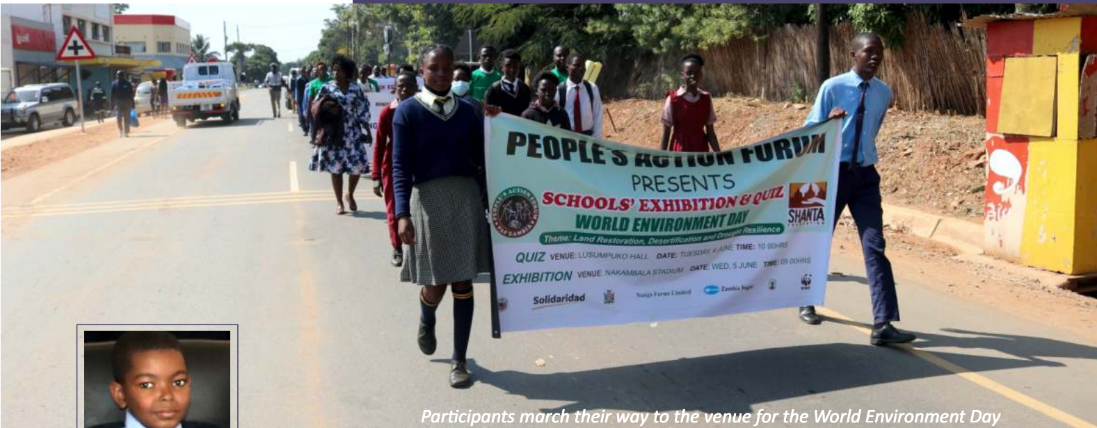
Participants march their way to the venue for the World Environment Day